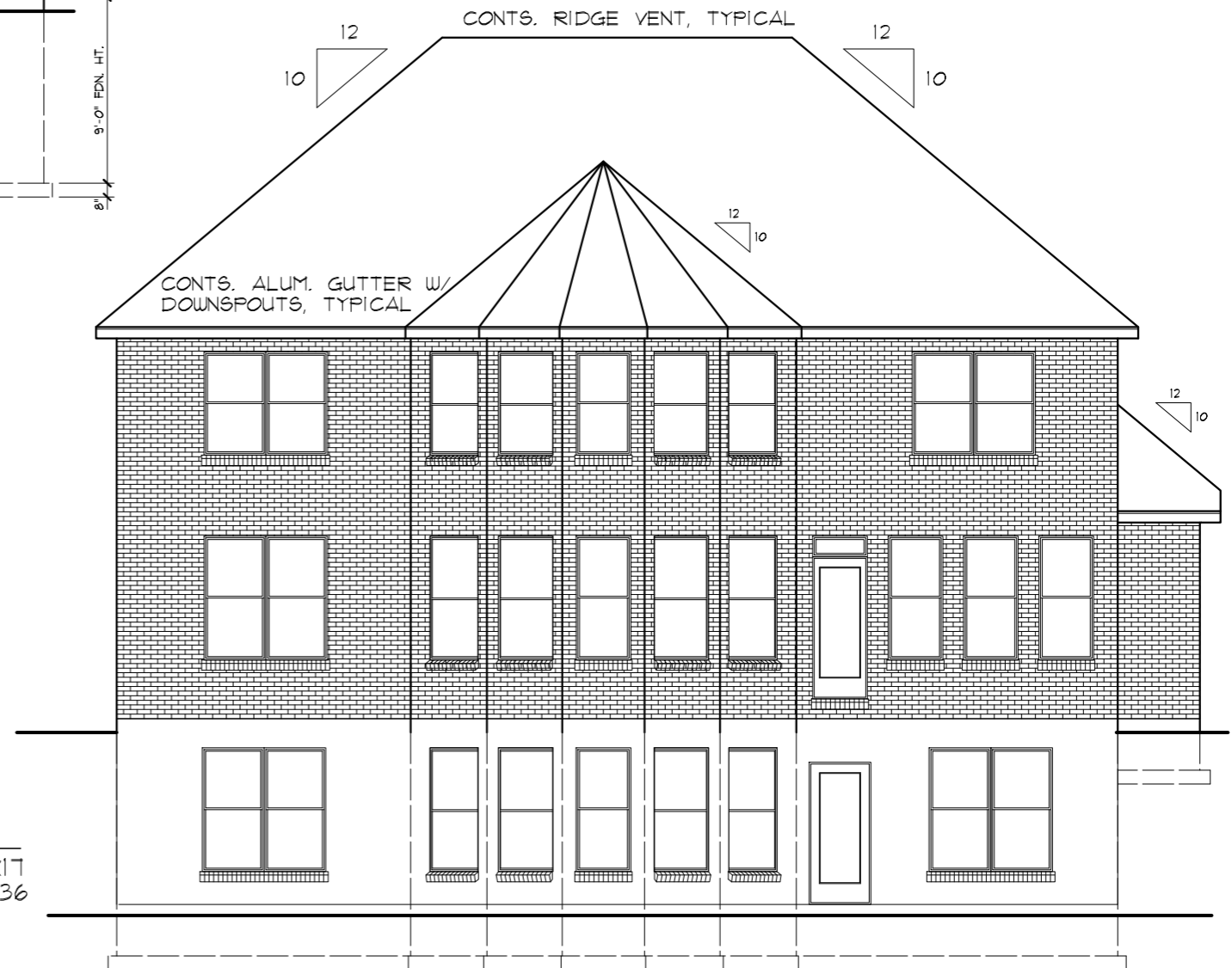
REAR ELEVATION SCALE: 1/8"=1'-0" ON 11X17 1/4"=1'-0" ON 24X36